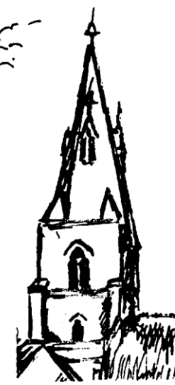
St Margaret's Braceborough