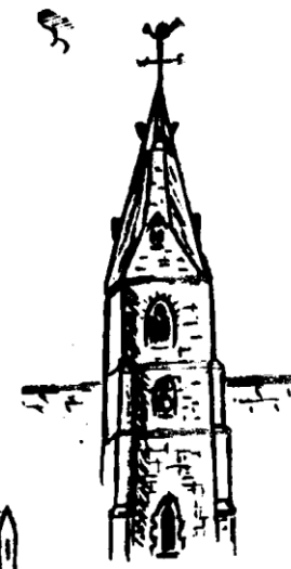
St Thomas' Greatford