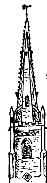
St Michael & All Angels Uffington