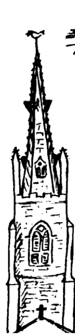
St Andrew's West Deeping