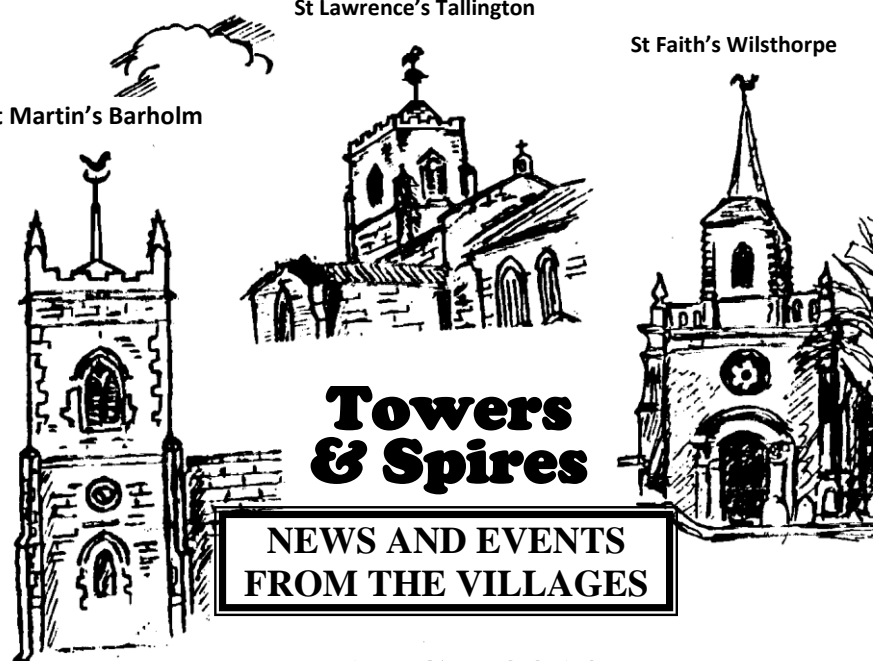
St Martin's Barholm